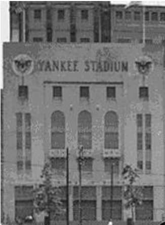
Gate 2: 1928-1973

The exciting reality is that more than 80% of the original 1920's Gate structure remains. Of the stadium's three main entrances, Gate 2 was the only one not significantly altered during the renovation, and we believe that Gate 2 is the most architecturally significant element remaining from the pre-renovated structure. Please refer to the three photos/renderings below that clearly illustrate this originality.