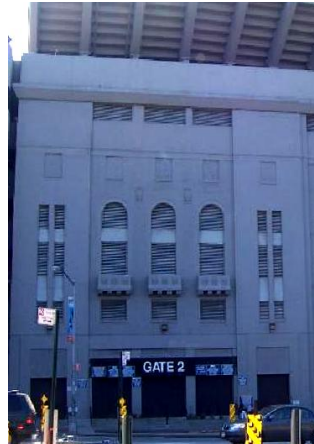
Gate 2: 1976-Current